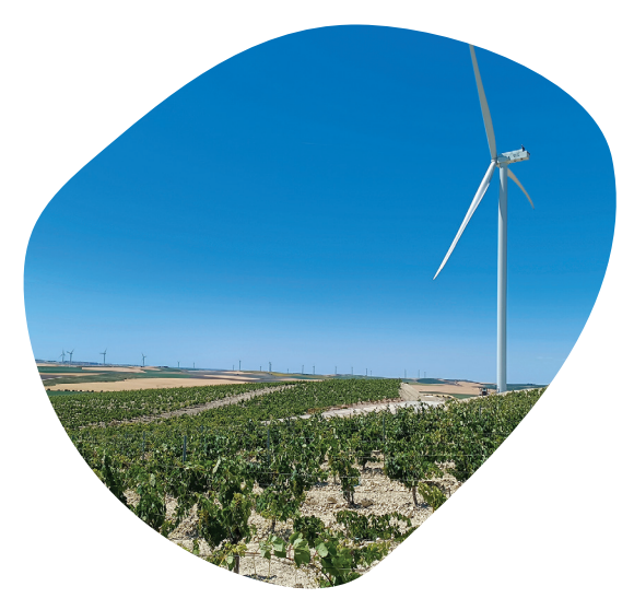
JEREZ DE LA FRONTERA (Spain) tourism and energy production.